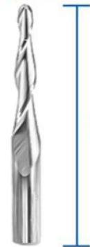
1/8" Up-Cut 'Drilling' Endmill