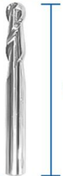
1/8" Ball Nose Endmill