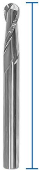
1/4" Ball Nose Endmill