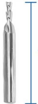
1/16" Down Cut Endmill