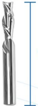
1/8" Down Cut Endmill