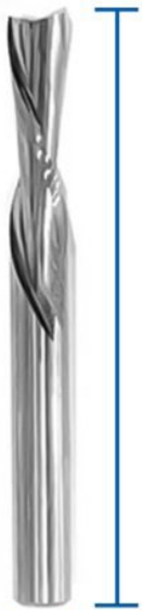
1/4" Down Cut Endmill