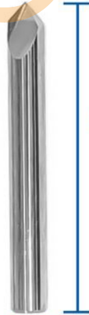
90° V-Bit Blade